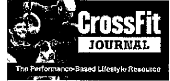
For Strength and Conditioning Ideas, check out CrossFit!