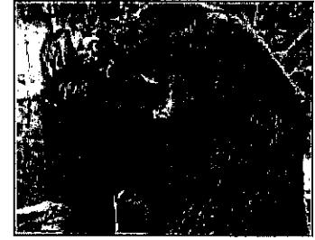
Check Out Doug Seus!

10. Toughness. Wrestling is a physical, contact sport. You learn that sometimes you just get poked in the eye. Physical and mental toughness go hand in hand. You learn that a little pain or struggle is part of the process of doing great things.